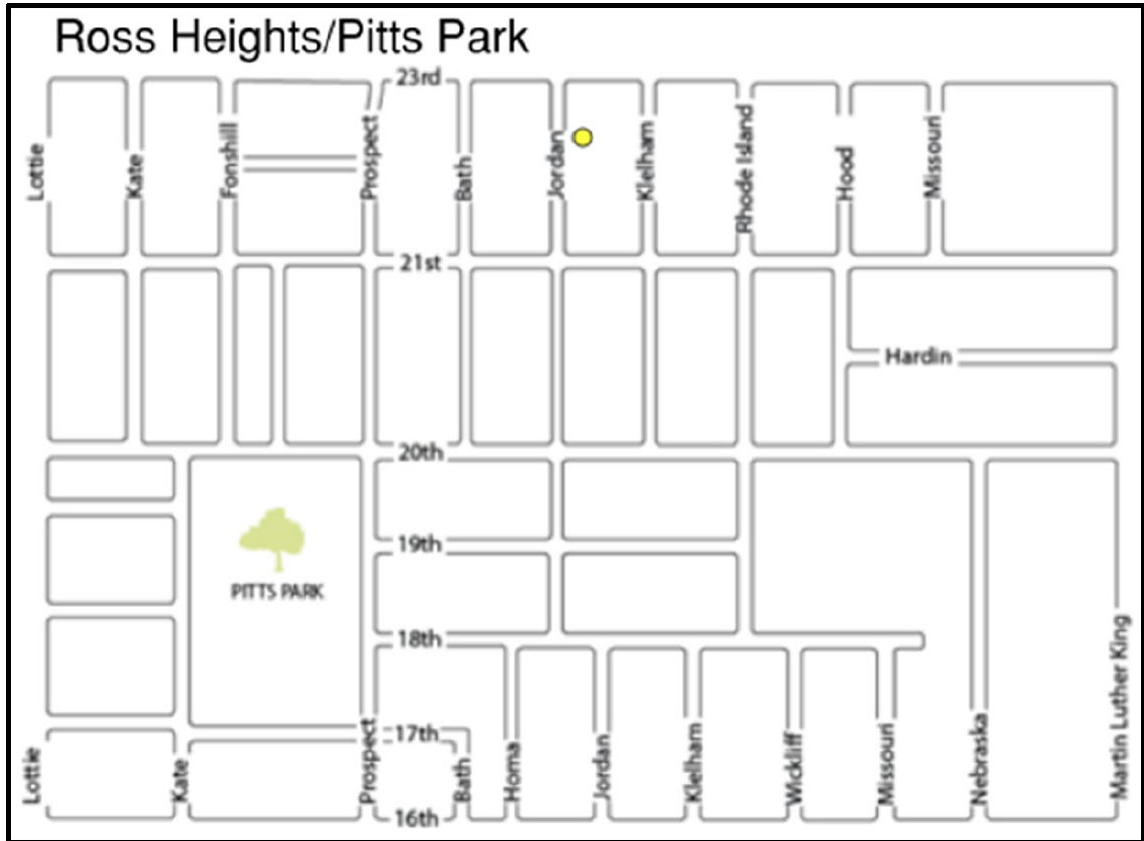
Exhibit 2: OKC SNI – Martin Luther King and Ross Heights/Pitts Park Neighborhoods